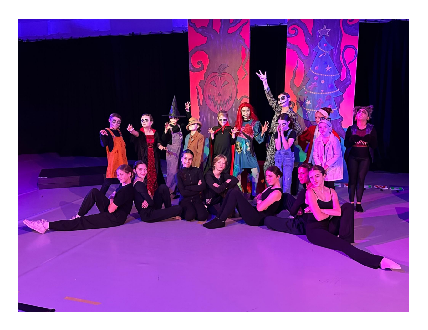
July 8-19 9:00am-2:00pm $900

This 2-week Musical Theatre camp will entertain and inspire as your young actors prepare to perform the spectacular Disney's Lion King Kids! The inspirational and upbeat music will keep your children moving and learning as we explore the world of music, acting, dance, animal stage makeup, and theatre tech together!